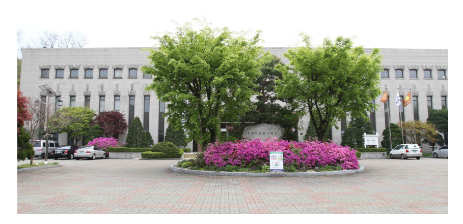
The NAS Building

Total Construction Cost: 2.4 billion won