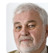
Jürgen Kocka (History of Modern Germany and Europe, Social History, Comparative History) Germany