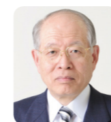
Ryoji Noyori (Organometallic Chemistry) Japan