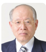
Ryoji Noyori (Organometallic Chemistry) Japan